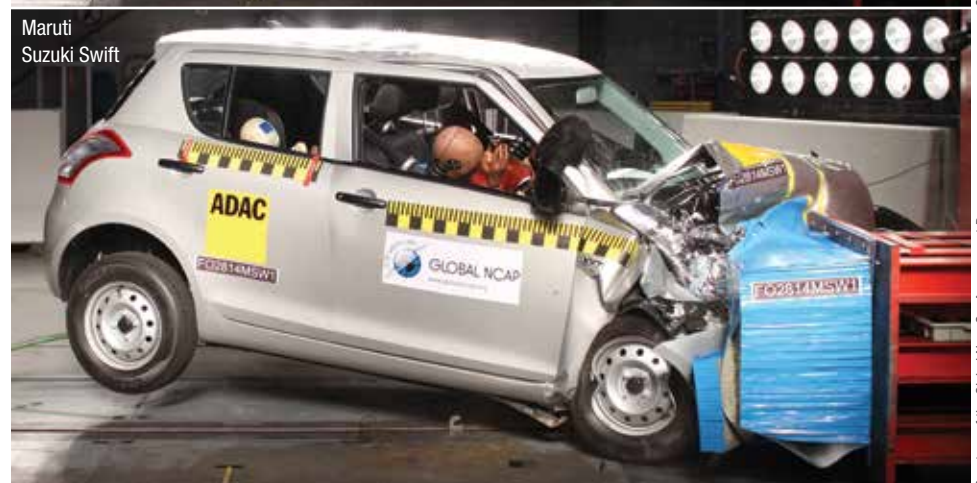
Two budget cars sold in India, the Datsun Go and Maruti Suzuki Swift, performed so poorly in Global NCAP frontal tests that they failed to earn any stars for protecting adults in a crash.

from India and other markets and redesign it. The Go's structure collapsed in the crash test, and the driver dummy's head contacted the steering wheel and dashboard.