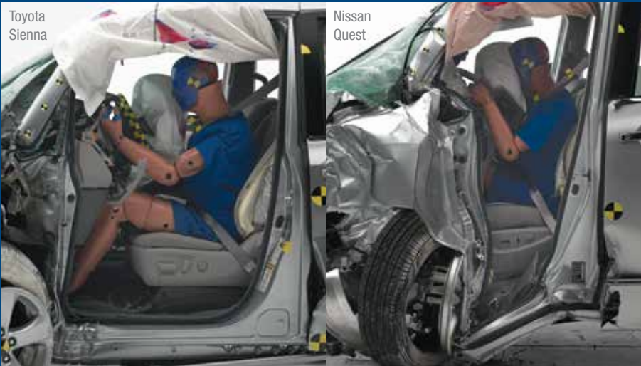
The door hinge pillar and instrument panel were pushed in 5½ inches during the test of the Toyota Sienna (left), but the minivan still managed an acceptable rating overall. Intrusion in the poor-rated Nissan Quest was much worse, reaching nearly 2 feet and completely trapping the dummy's left leg.