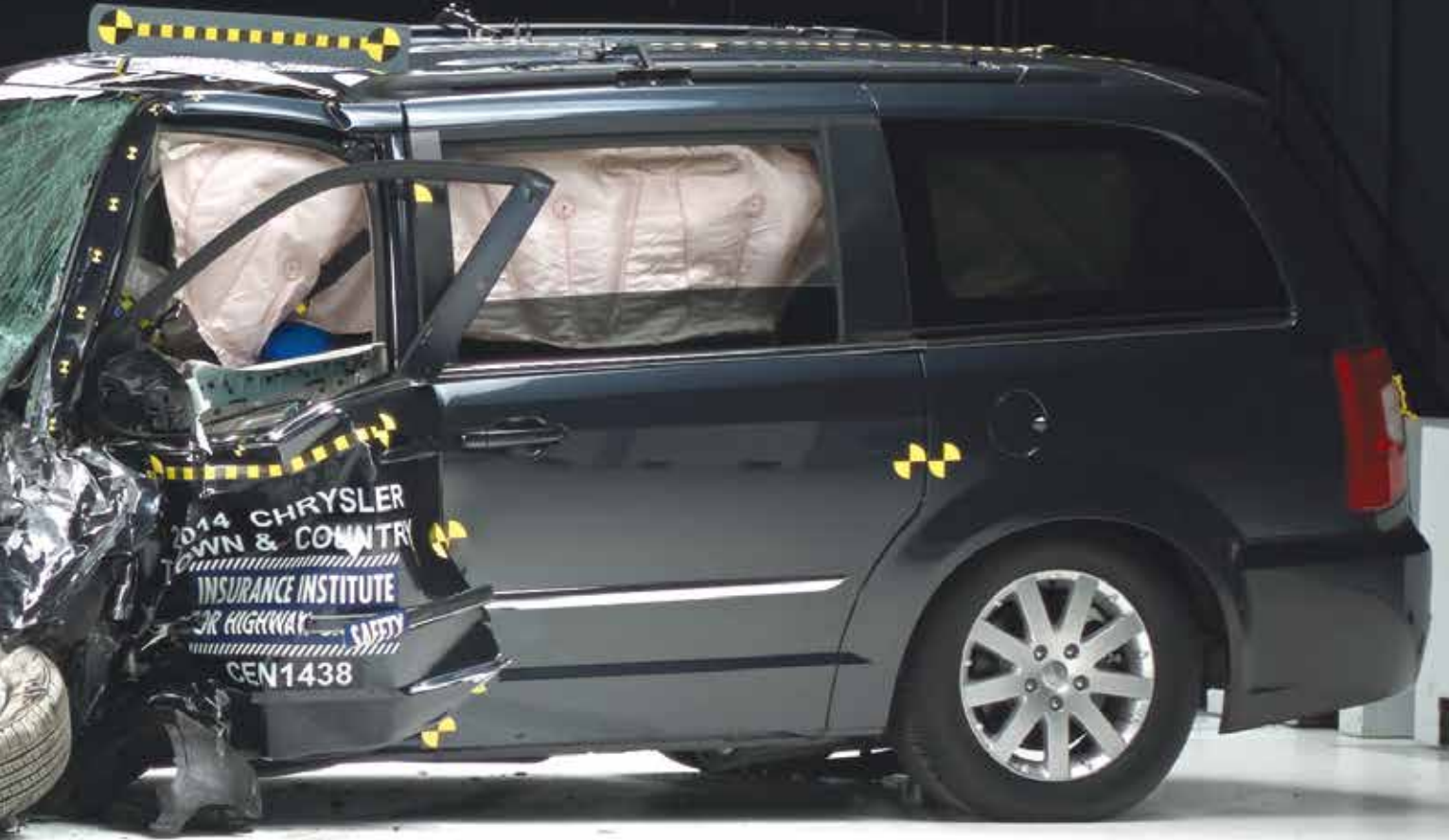
Chrysler Town & Country

that the risk of any injuries would be low in a crash of this severity.