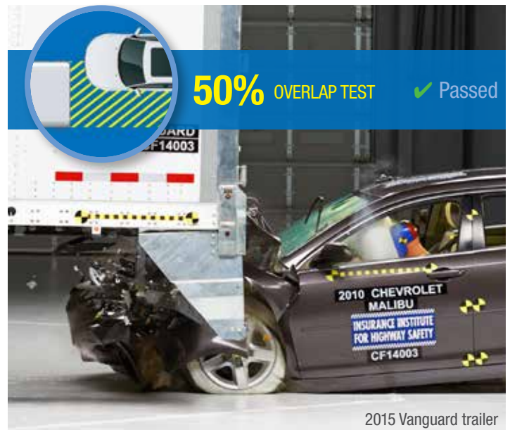
2015 Vanguard trailer

Two prior generations of Vanguard trailers (2007 and 2013 models) failed the Institute's 50 percent overlap evaluation. Vanguard redesigned the trailer for 2015, and it passed. This time, the underride guard successfully stopped the Malibu from sliding beneath the trailer.