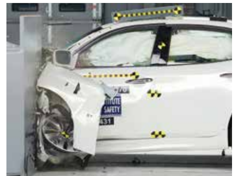
The Infiniti Q70 is a TOP SAFETY PICK+ .

The BMW 5 series performed somewhat better, earning a marginal rating. Like the MKS, the 5 series also saw as much as 12 inches of intrusion. However, there was considerably less intrusion in the upper interior. The dummy's movement was well controlled. Injury measures indicated that left leg injuries would be likely. The marginal rating applies to 2011-15 models.