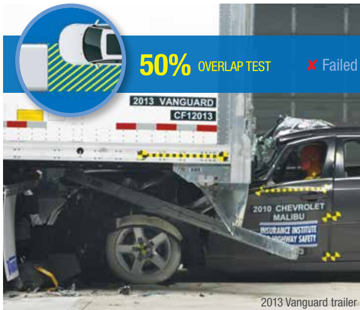
2013 Vanguard trailer

built to the tougher Canadian standard passed both the full-width and 50 percent overlap tests. Other manufacturers are working on design improvements to their dry van trailers in response to IIHS evaluations and are expected to request retests. ■