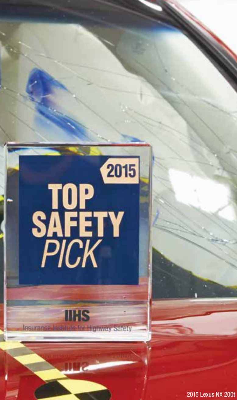
2015 Lexus NX 200t