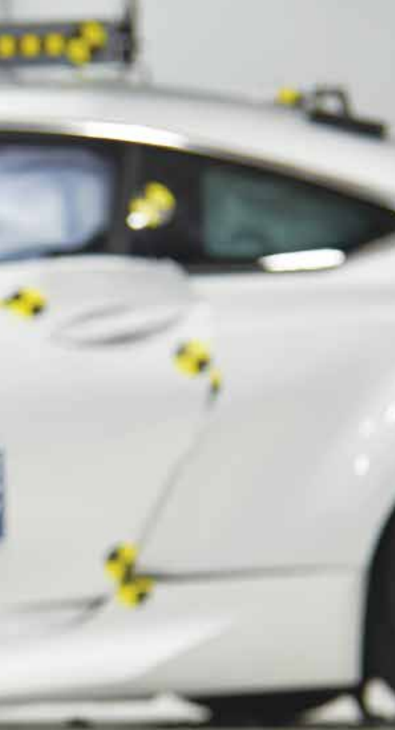
2015 Lexus RC 350