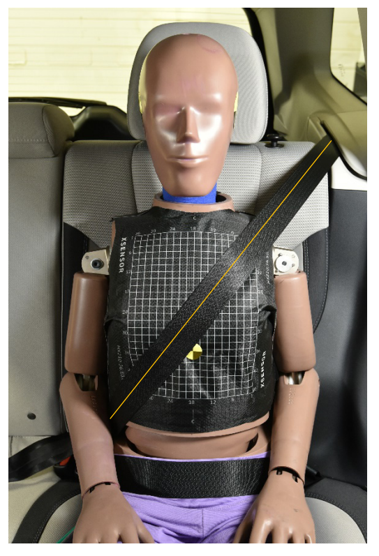
Figure 3B. Natural shoulder belt position

12. Position the dummy's arms and hands.