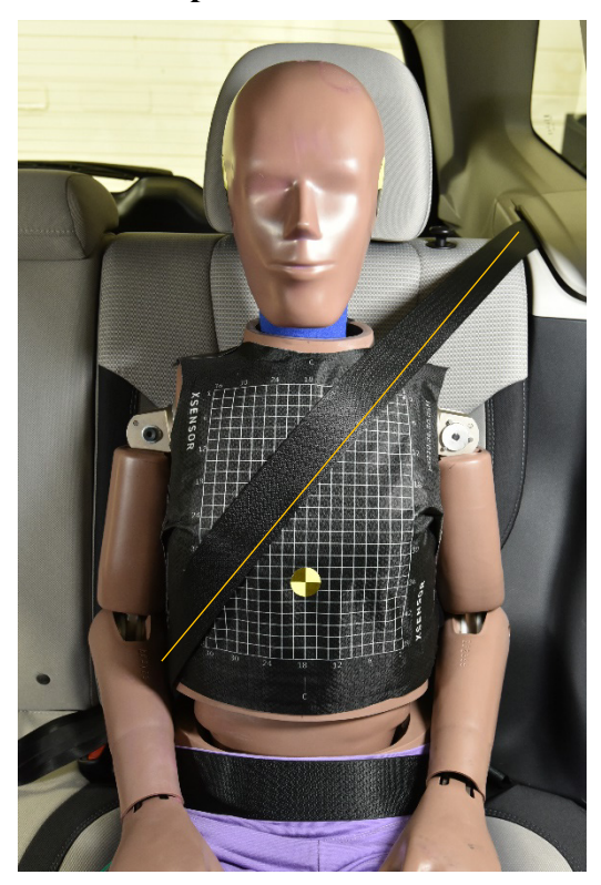
Figure 3A . Unnatural shoulder belt position