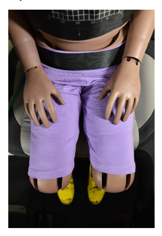
Figure 4 Hand placement for dummies with full arms