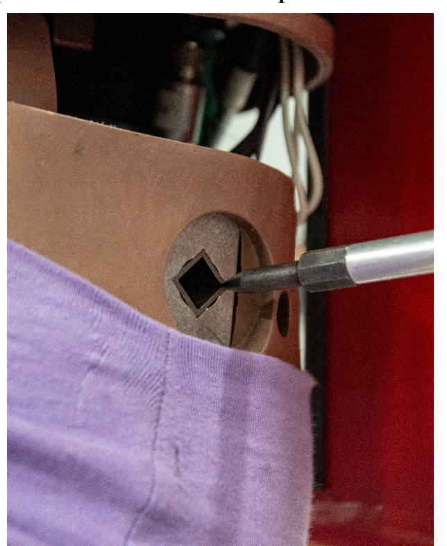
Figure A1 CMM point 1: Rear corner of the H-point tool insert location